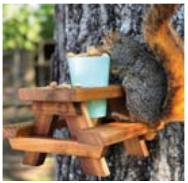
A squirrel dining table made by Finn Girdlestone By Diane Claytor

mind." The imagination and creativity of our local youth exemplify this quote. New skills have been learned, talents perfected, businesses opened. While none were quite as profitable as Safahi's, they were all equally impressive. Tutors